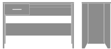
EXDK102L 45.5W 19.5D 30H