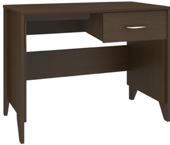
Model: EXDK101R 40.5W 19.5D 30H

The contemporary Essex collection features a distinctive leg design providing a dimensional look that allows for easy cleaning. Select tone-on-tone or contrasting wood-grained finishes for legs and top. Customizable and available in a variety of sizes. Sophisticated hardware delivers added style.