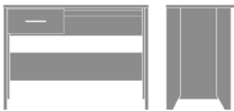
EXDK101L 40.5W 19.5D 30H