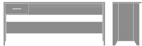
EXDK103L 69W 19.5D 30H