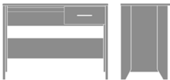
EXDK101R 40.5W 19.5D 30H